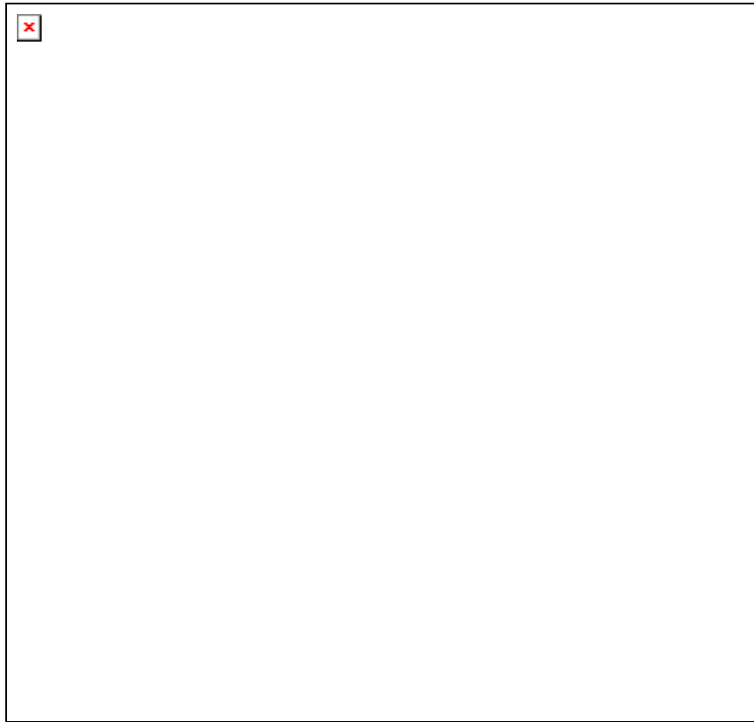
Figure 2: Five swellable elastomers on a 5-1/2 x 7 in. solid expandable tubular system achieved zonal isolation and facilitated accurate placement of hydraulic fractures.