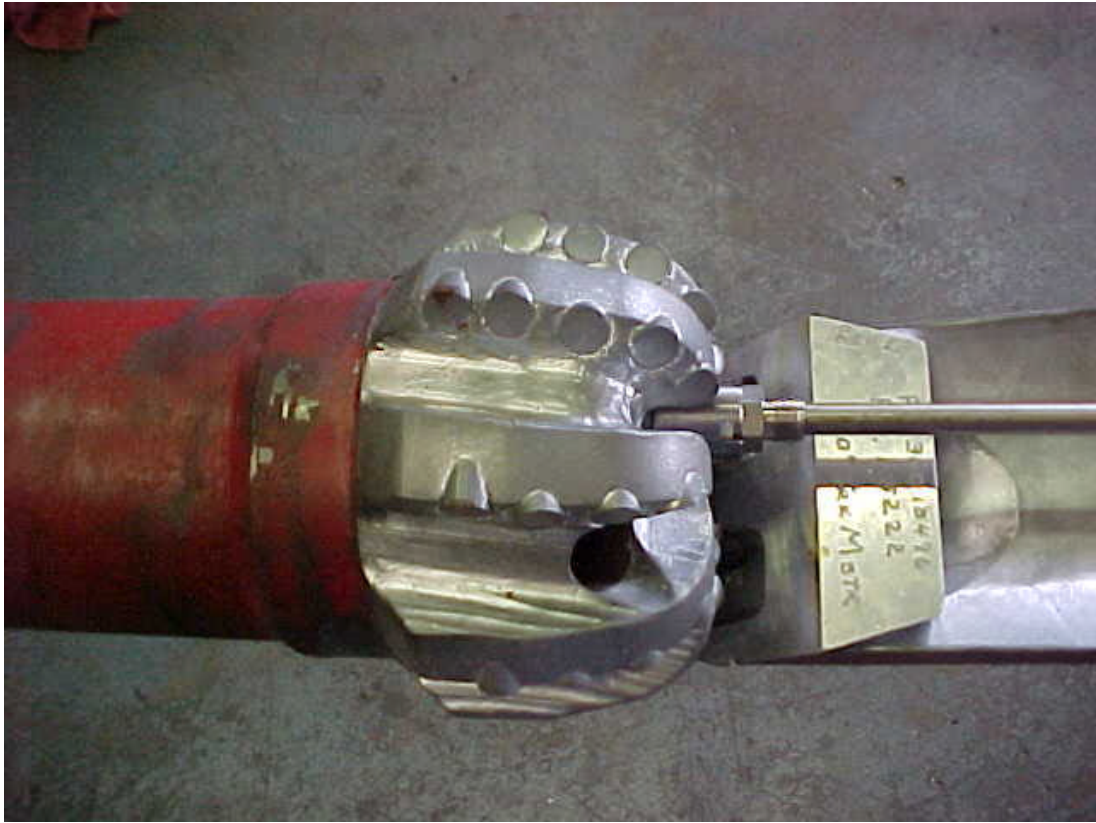
Figure 4 – Mill Whipstock Attachment