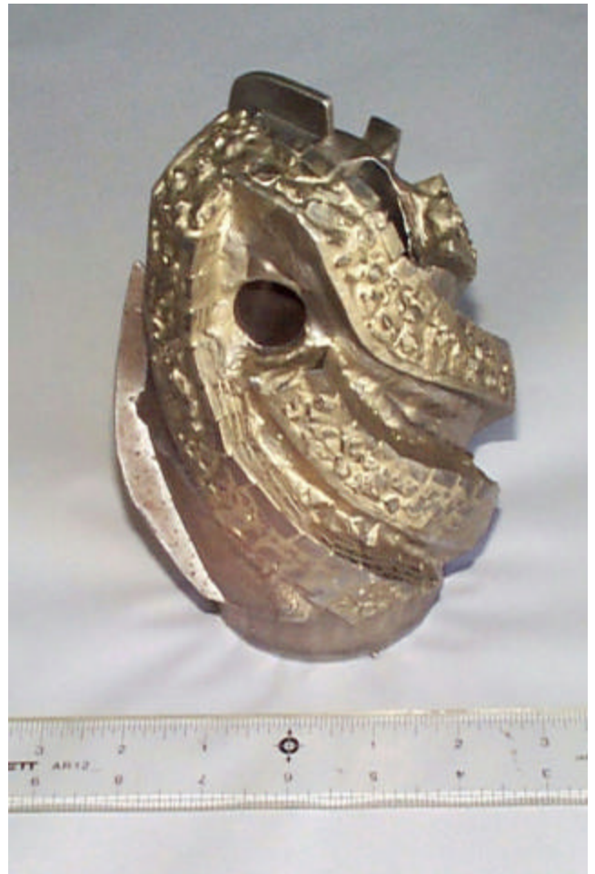
Figure 2 – Carbide Mill