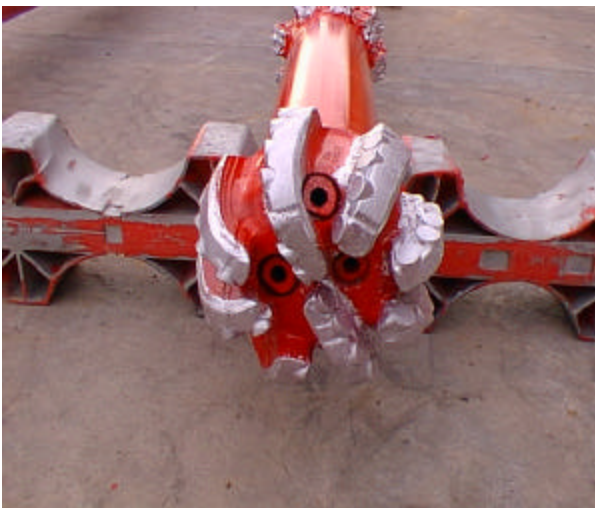
Figure 3 – New Mill