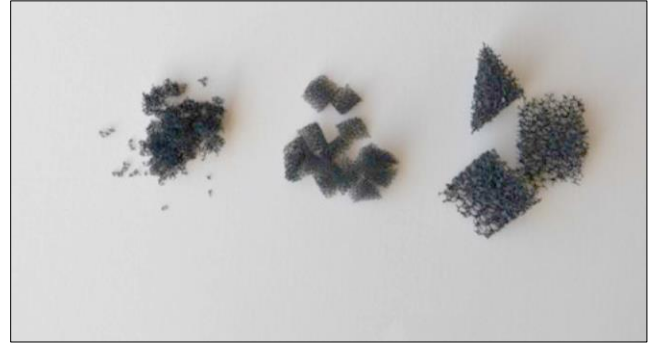
Figure 2—Fine, medium, and coarse SRF.

sized reticulated foam (SRF). Three SRF sizes (fine, medium, and coarse) are available and can be selected based on the assessment of the loss rate and potential size of the void to be sealed off. Fine SRF is \pm 3 mm, medium SRF is approximately 10 mm, and coarse SRF is approximately 1 in. Figure 2 shows an example of the SRF materials.