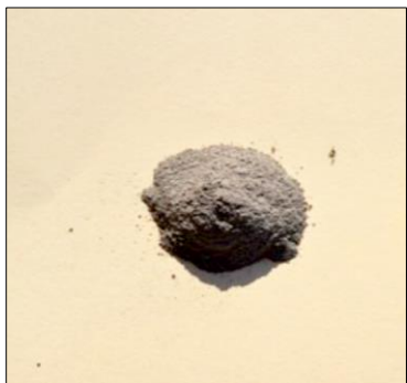
Figure 4—FSMMP LCM.

When SRF is mixed with a high-fluid-loss LCM formulation, laboratory tests show that it can enable such a pill to seal a slot as wide as 10 mm with a 4,000-psi pressure differential ( Ref. 4 ).