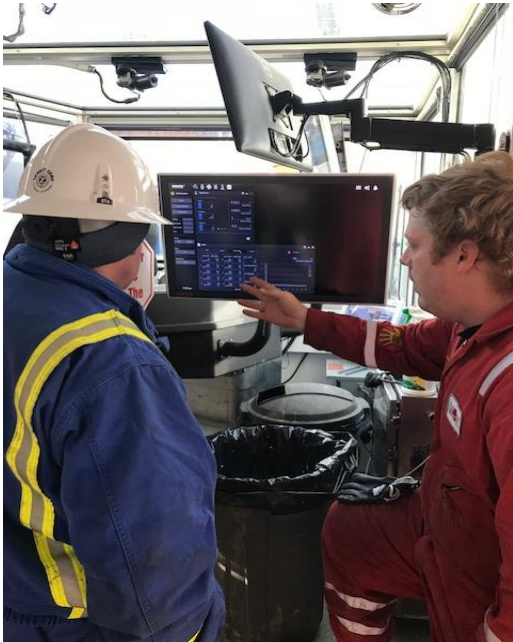
Figure 5: Demonstration of MPD App on AOS screen.

flow, monitor the chokes performance for faults, and make adjustments on the system using the same familiarity and training they had on other apps on the AOS.