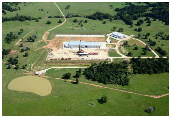
Figure 3: R&D Technology Center.

The complete system framework was tested on an advanced R&D Technology Center 2 , designed for testing and validation of new technology. The test facility comprises a full-scale land rig with state-of-the-art drilling equipment and "wired drill pipe" for real-time interpretation of downhole pressure, as illustrated in Figure 3.