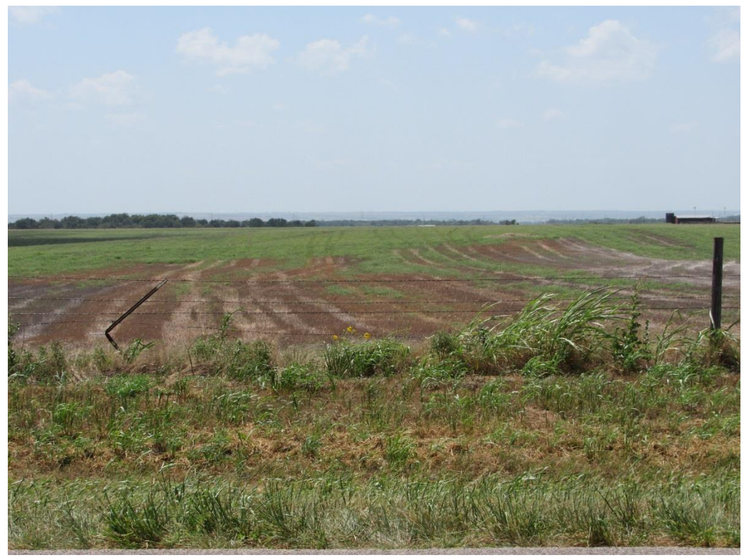
Damaged field from landspreading oil-based cuttings