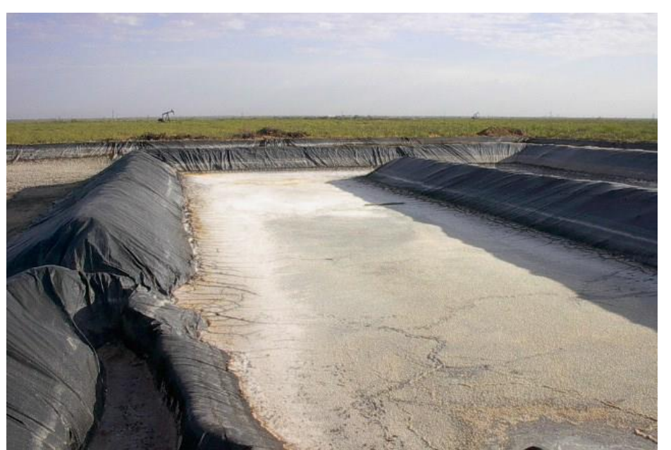
Figure 1: High-Chloride Drilling Waste