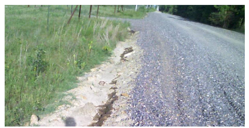
Figure 4: Diesel Runoff from Roadspreading