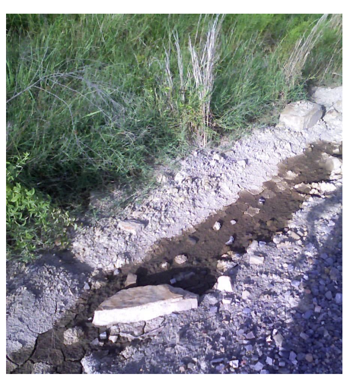
Figure 5: Diesel Runoff from Roadspreading