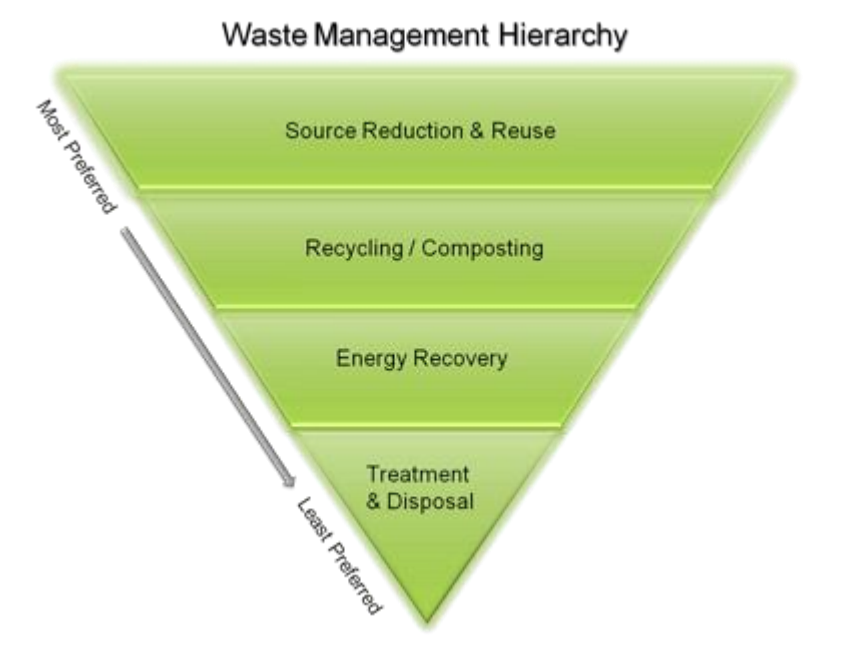
Figure 2: USEPA Waste Management Hierarchy