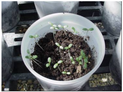
Fig. 3 – Medicago sativa in salt-leached drill cuttings after two weeks of growth.

The seed germination and root elongation test is used to demonstrate the reduction in plant toxicity. In addition to chemical contaminants of concern, seed germination studies ensure that soil structure and chemistry is appropriate to support plant growth. The procedure requires that twenty alfalfa (Medicago sativa) seeds be planted in each test container and allowed to grow for 14 days (Fig. 3); at the end of that time the germinated seeds were counted and their root lengths measured. This information was entered into statistical software that determines the concentration-response curves for seed germination and root elongation. This test determines the acute toxicity of drilling fluid systems and additives for onshore application. It is based on the procedure outlined in ISO 11269-1 and the EPA Seed Germination and Root Elongation test method. Positive seed germination results will attest to the potential for use as soil of the leached cuttings and amendment mixtures.