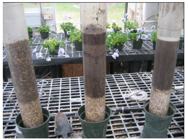
Fig. 2 – From left to right: first tube contains 50% gravel, second contains 50% peat, and third contains 100% cuttings.

Water was flushed through the tubes and the leachate was collected in the suspended containers beneath the tubes. Each flush contained 250 mL of water; this volume was chosen arbitrarily and will qualify as a "wash" for all leachate Later, it was determined that the amount of water used per wash should create a 1:1 dilution after passing through the medium in adherence to LA 29-B procedure for chlorides testing. Therefore, in subsequent studies the amount of water in each "wash" is equal to the mass of drill cuttings present in that sample on a dry-weight basis. The "washes" were repeated until the leachate reached 300-ppm chlorides. The leachate was tested for chlorides using the titration method with silver nitrate and potassium chromate; the results were confirmed using a refractometer.