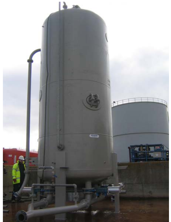
HCB Tank built for Tests

The testing of the HCB system was conducted from June 2005 to October 2005 initially at the fabricators yard in the UK and later at an onshore oil supply base in Peterhead where all tests were witnessed by UK based operator staff. The oil-based mud cuttings were supplied by a major UK operator as representative of North Sea cuttings. The HCB system was set up on the base and all interconnecting pipe work, air lines, cuttings handing lines, etc. were rigged up within a banded test area. The HCB tank built for these tests is shown in the photograph below.