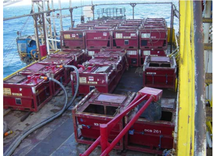
Cuttings boxes on North Sea drilling rig

1000 tonnes of cuttings and require several hundred cuttings boxes. In a typical offshore operation, all these boxes have to be lifted onto a boat, transported to the rig, lifted up onto the rig, and lifted to the filling station on the rig. Once filled with cuttings, the box is lifted away from the filling station, lifted down onto the boat, and finally lifted off the boat when it returns to the shore base. This means six or more crane lifts are required for each cuttings box filled, and at 200 boxes per well this amounts to 1200 individual crane lifts per well. This represents a significant safety risk to workers at the rigsite, on boats and at the shore base. In addition, these boxes can take up considerable deck space on a rig, many of which were never designed for these types of operations. See photograph below.