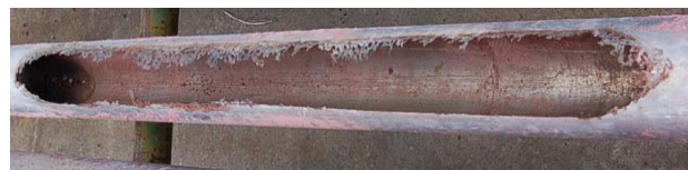
Pic 3: Window or Opening Cut in the 5-in Duplex 25% Chrome Casing by Mill Shown in Pic 2

The opening cut in the 5-in Duplex 25% chrome casing, is shown in Pic 3. It shows tapering of the window in the mid section. This tapering of the window width was caused mainly due to the mill and whipstock wear.