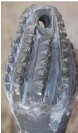
Pic 4: Picture Depicting Mill Wear After successfully Sidetracking through Duplex 25% Chrome CRA Casing in One Trip

Pic 4 shows the mill after completing this successful sidetracking test. Pic 5 shows the window or the opening cut successfully in the 5-in, 23.2# Duplex 25% chrome CRA casing by mill shown in Pic 4.