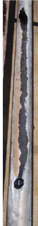
Pic 5: 5-ft Long Window or Opening Cut in 5-in, 23.2# Duplex 25% Chrome Casing by Mill Shown in Pic 4