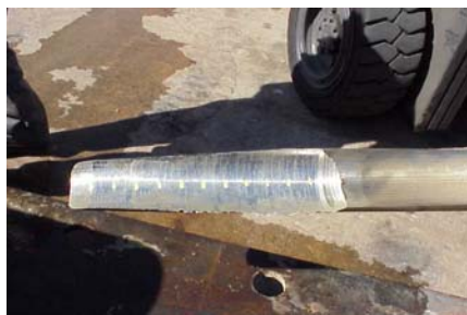
Pic 1: Picture Depicting Preferential Wear of the Standard Whipstock in the Initial Tests

Initial testing aided in the analysis and study of the standard system's performance in sidetracking through such casings. These tests were carried out in 5-in 23.2 #, Sumitomo SM25CRW-125 grade casings having 4-in ID. The tests confirmed that all the existing standard mill assemblies tend to preferentially cut the whip rather than cutting a window in the chrome casing. The modifications made to the mill and whipstock design were derived from the failure analysis of these tests. Pic 1 shows the wear on the whipstock face due to the mill preferentially cutting the whip.