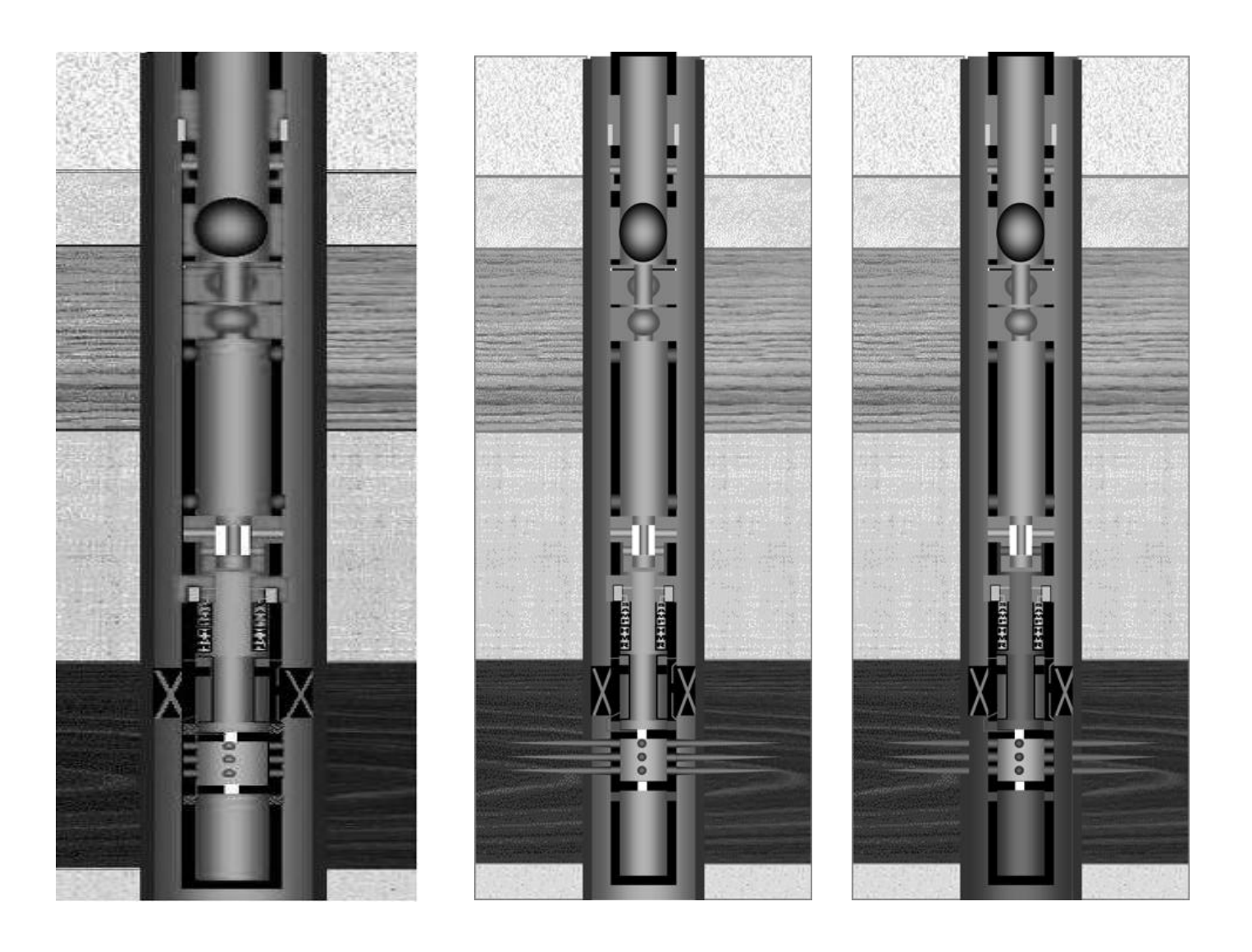
Fig. 3 — Annulus pressure is applied to activate the firing head and open top and bottom flow vents, allowing junk and mud to go to the lower chamber.