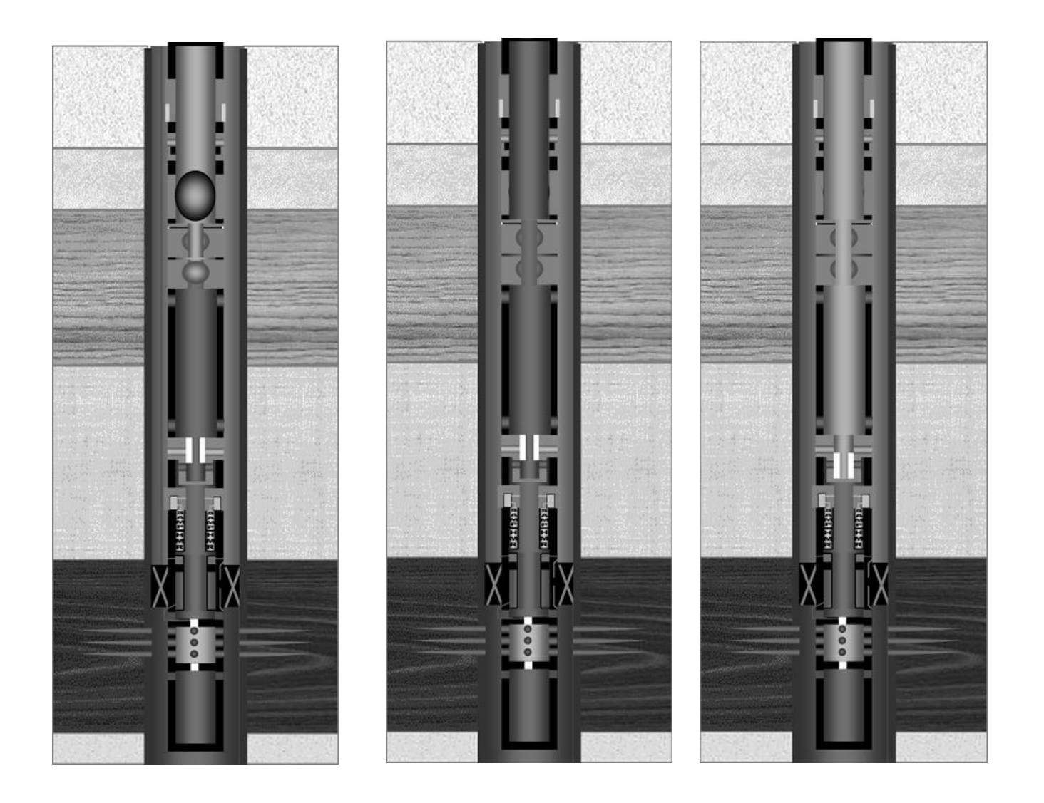
Fig. 6 — Annulus pressure is reapplied to shift the lower surge/circulating valve to the well test position, starting the second surge and shut in period.

Fig. 7 — Annulus pressure is reapplied to open the upper surge valve, starting the third surge/flow period. Well is circulated, and a large volume sample is recovered at surface.