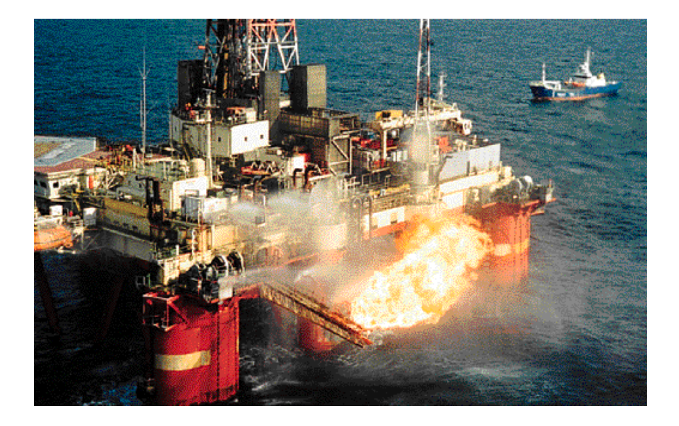
Fig. 1 - Photo of a typical offshore flaring operation.