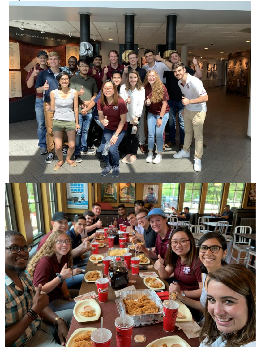
TAMU/Lamar Tailgate, Sept. 14th, 2019:

Students carpooled to the Baker Hughes facility in The Woodlands, TX. Tour was informative and fun. Lunch was provided to those who attended.