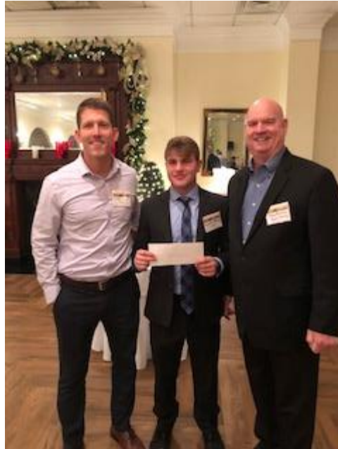
Top Right: LSU Scholarship Award recipients