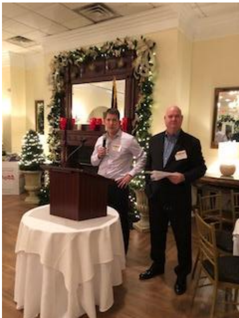
Below Middle: NSU Award recipients and their professor.