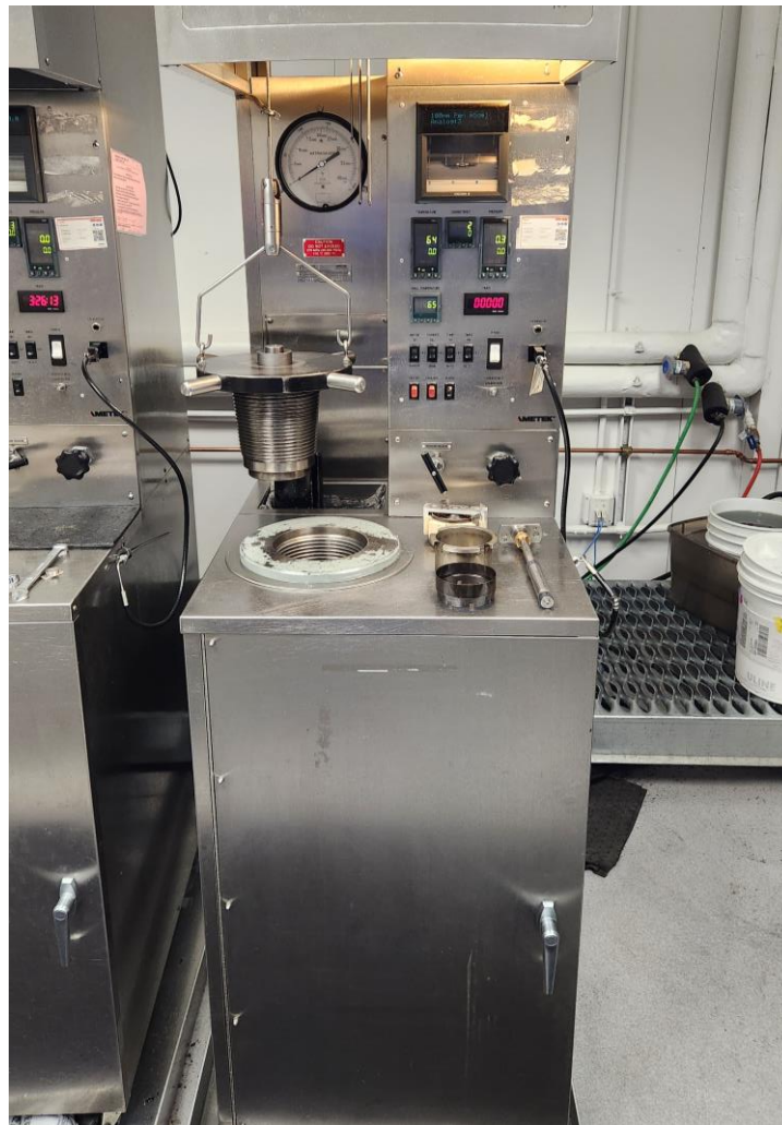
Fig. 2—Pressurized consistometer, with chamber close-up on the right. The HTHP-SC is designed to fit into this chamber.