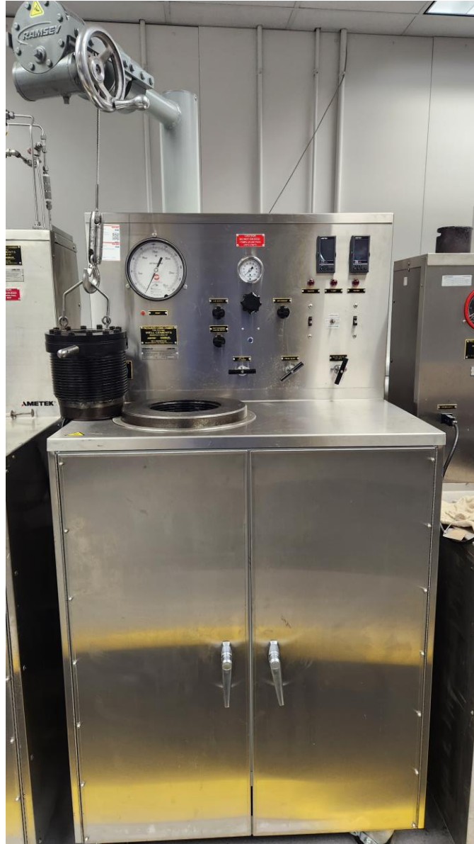
Fig. 3—Pressurized curing chamber, with larger chamber close-up on the right. This equipment is more suitable for long-term testing.